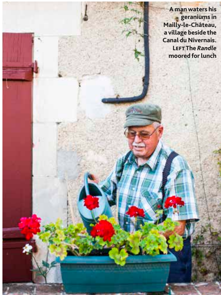
A man waters his geraniums in Mailly-le-Château, a village beside the Canal du Nivernais. LEFT The Randle moored for lunch