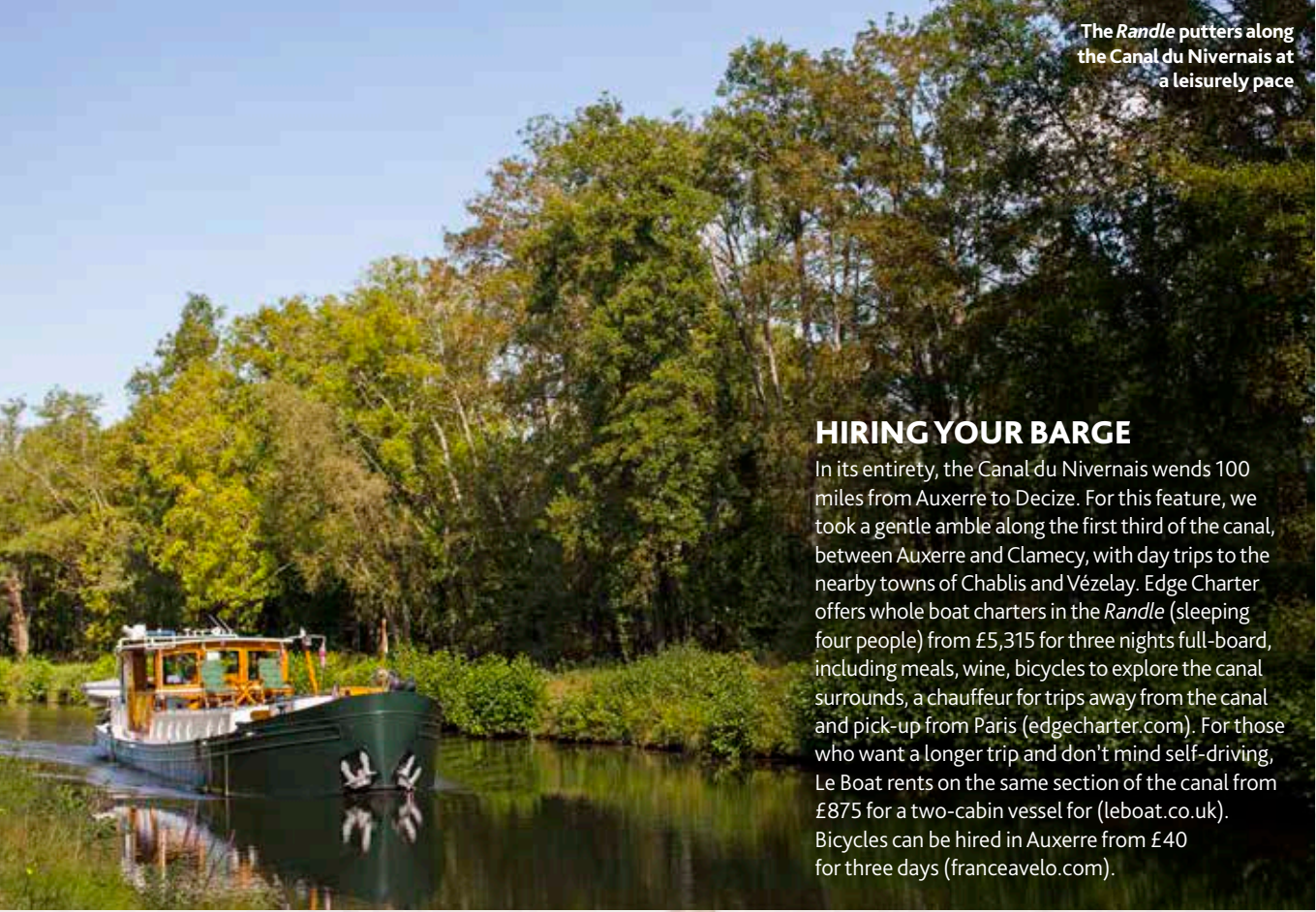
The Randle putters along the Canal du Nivernais at a leisurely pace