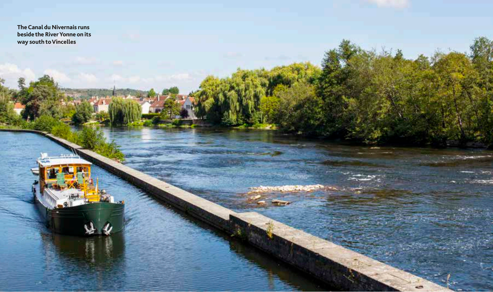
The Canal du Nivernais runs beside the River Yonne on its way south to Vincelles

We dined in the tiny and appropriately named La P'tite Beursaude – one whitewashed, wood-beamed room with a red-terracotta tiled floor – and so small it would have been easy to miss but for the blue painted door and baskets of pink geraniums outside. A waitress wearing traditional Morvan dress, with wide lace sleeves, brought us an amuse bouche of oeufs en meurette – tiny quail's eggs cooked in bourguignon sauce, and a speciality of the house. Two identical twin men, wearing identical paisley shirts, were applauded by their companions as two identical bowls of steaming snails, cooked in Chablis wine, arrived in front of them.