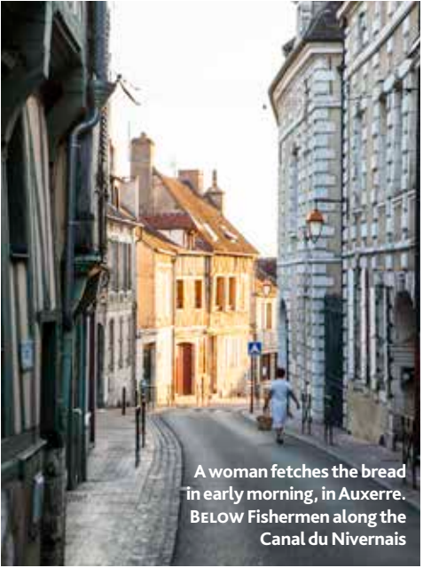
A woman fetches the bread in early morning, in Auxerre. BELOW Fishermen along the Canal du Nivernais

'We dined in a whitewashed, wood-beamed room with a red-terracotta tiled floor'