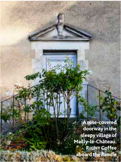
A rose-covered doorway in the sleepy village of Mailly-lé-Château. RIGHT Coffee aboard the Randle